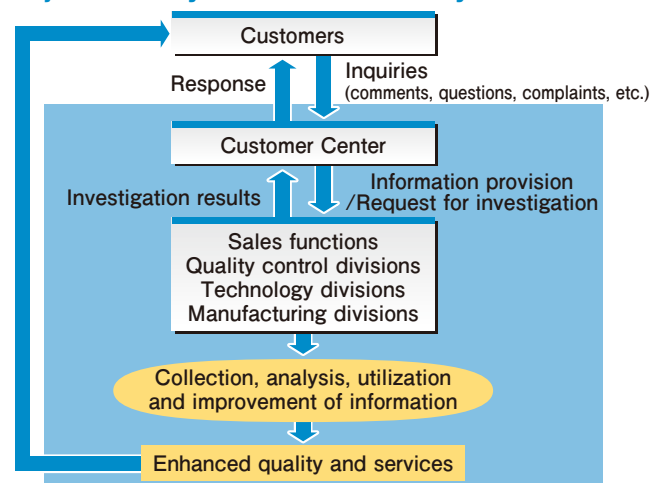
Fujitsu Battery Customer Center System

A customer center is also open to customers who inquire about Fujitsu batteries, which are consumer products, to deepen the relationship of trust with our customers. The opinions and comments received by the center are accumulated and fed back to future product development processes for improvement in order to provide better products and services to our customers.