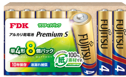
Premium S "Sustainapack" AAA alkaline batteries