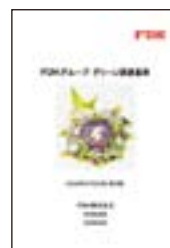
FDK Group Green Procurement Standards