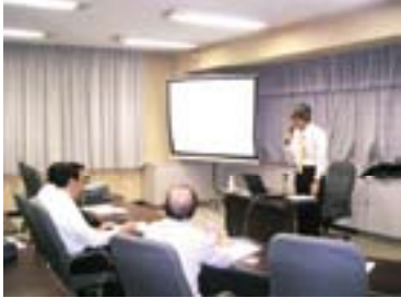
Briefing Session on Export Control

tance. In FY2007, domestic sites were provided with briefings about export control (for the strengthening of security trade control), the Act against Delay in Payment of Subcontract Proceeds. Etc. to Subcon tractors, and the Authorized Exporters' Program.