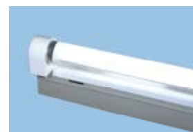
Product Model FLED40S-40-PSW-LHH