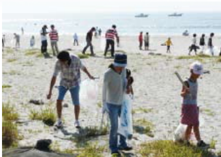
Lake Hamana (Shizuoka Prefecture) Participated in cleanup activities.

As a global citizen, the FDK Group hopes that our beautiful planet and its bountiful nature will last forever. Thus, we are committed to developing social contribution initiatives and enhancing communication with the local communities in which we operate.