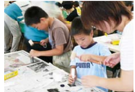
Dry cell workshop