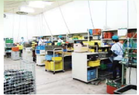
PC disassembly work

The FDK Group also conducts an information-equipment and electronic-equipment recycling business aimed at furthering the creation of a sustainable society. Operating as the Chubu Region Recycling Center of Fujitsu Recycle System (FRS), FDK Eco-Tech Corporation collects and recycles the materials contained in used PCs and other information equipment, thereby contributing to the recycling and reuse of resources.