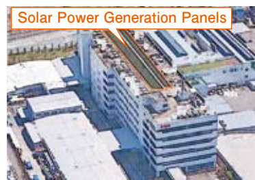
Conceptual drawing of FDK Twicell's solar power generation panel installation

Equivalent in camphor trees Approximately 112 trees