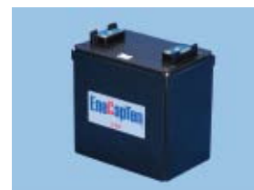
Product Model EneCapTen ® ECM45 series