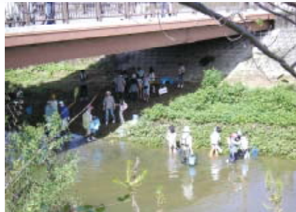
Umeda River (Aichi Prefecture) Participated in cleanup activities.